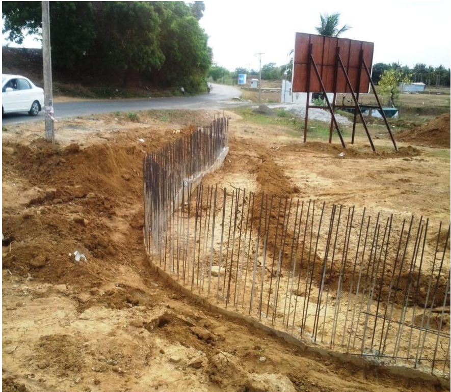
Left side of Front compound wall- Final lift reinforcement works under progress